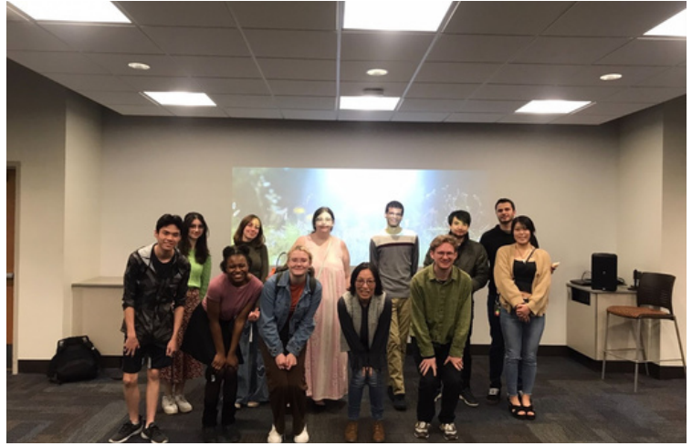
Korean Movie Night

We hosted the first Korean movie night, which had 14 attendees! We watched "Minari", a 2020 American drama film about a Korean American family who moves to Arkansas. There was a discussion regarding the film afterwards, and many students expressed that we should host a similar event next semester. So, a second Korean Movie Night will be coming in Oct. 2023!