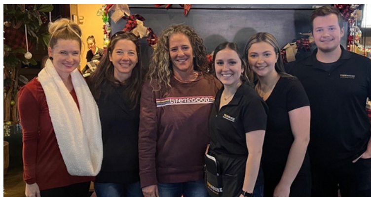
ASL Instructors and Students