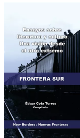
New Borders Book Covers