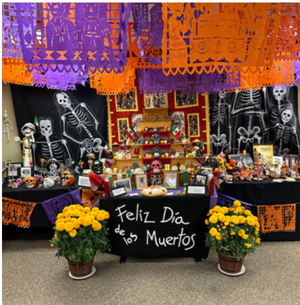
Día de los muertos altar