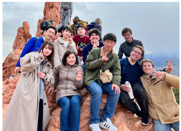
UCCS and Kanazawa Students