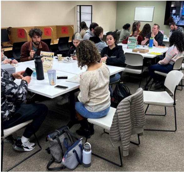
Excel Language Center