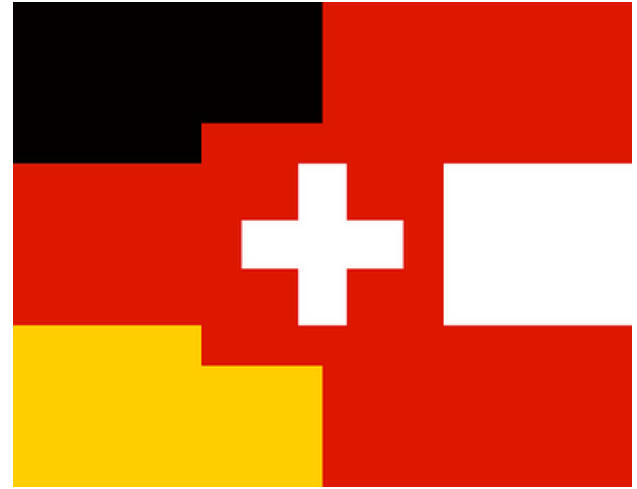
German, Swiss & Austrian Flag

Servus and Hallo from the UCCS German Club! We are excited to announce our upcoming events in the Fall 2023 Semester to help share our passion for the German Culture and the German Language with our fellow students. We are planning to hold a German Movie Night at the Excel Languages Center in August, an Oktoberfest event in Clyde's Gastropub in September, and to host a Christmas Party at the Excel Languages Center in December. Furthermore, the German National Honor Society will be holding a dinner to commemorate new members and celebrate graduating members during the Fall '23 Semester.