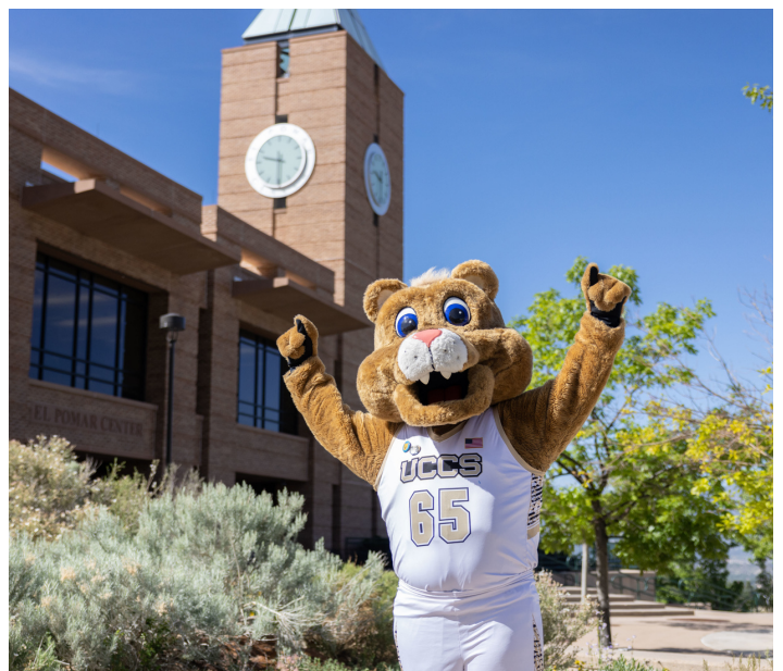
Clyde Celebrating.