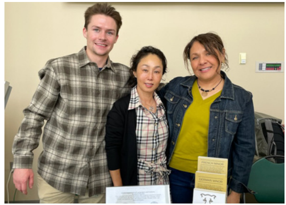
Tabling on November 2nd

The 15th annual Day of the Dead celebration was held on the University's campus on November 2nd, 2022 as part of the University's yearly Multicultural Day. In honor of and remembering deceased friends, family, and loved ones, the exhibit is an important part of the event. There were three sections to the altar this year, an altar with images of the departed on it, an altar with ofrendas, and a table that contained the catrinas.