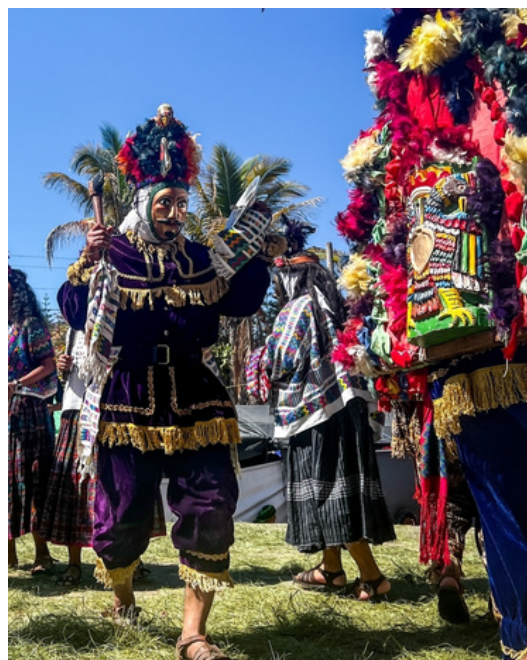
Rabinal Achí Celebration.

RABINAL ACHI Rabinal Achí , one of the oldest plays in the Americas, is staged every year in the town of Rabinal, in Guatemala, and depicts a struggle between Mayan rulers. Over the last 500 years, the drama has become a symbol of indigenous resistance to Spanish colonization and a repository of Mayan culture and tradition. This Fall, join students of the Spanish and Visual and Performing Arts programs to explore this colorful historical drama in SPAN3910/FCS3990/THTR3210. This cross-listed class, with visiting experts in a variety of academic fields, will study the historical context and development of the play and its relationship to European and American dramatic traditions.