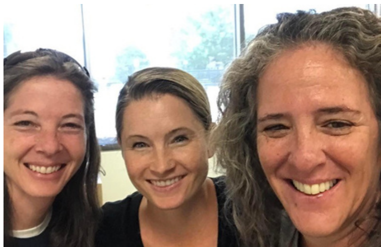
ASL Faculty & Staff Photo

ASL CLUB hosted several successful meetings and events. The most recent event, 'Movie Night', was fully booked! The movie shown was titled 'CODA', which stands for Children of Deaf Adults. It gave perspectives on the life experiences of children growing up with Deaf parents. Attendees enjoyed the movie along with delicious popcorn and snacks!